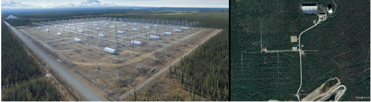
Figure 2. Left: High Frequency Active Auroral Research Program (HAARP) facility in Gakona, Alaska (USA). Right: Norwegian Tromsø ionosphere heating facility.

Figure 2 (left) shows the HAARP ionospheric heater in Gakona, Alaska (USA). Its 180 units are capable of producing a total radiated power level of 3.6 MW with an effected radiated power of approximately 575 MW [36, 41]. Figure 2 (right) shows one of the other ionosphere heaters, this one in Tromsø, Norway, with an effective radiated power of 300 MW [29, 31, 42] which, like HAARP, is capable of triggering earthquakes [38-40].