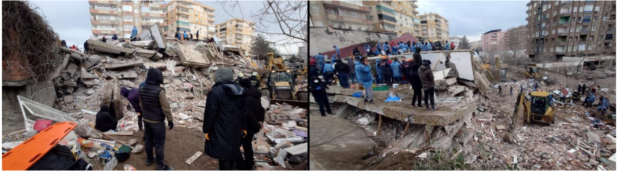
Figure 1. Scenes of damage from the February 6, 2023 earthquake in Turkey.