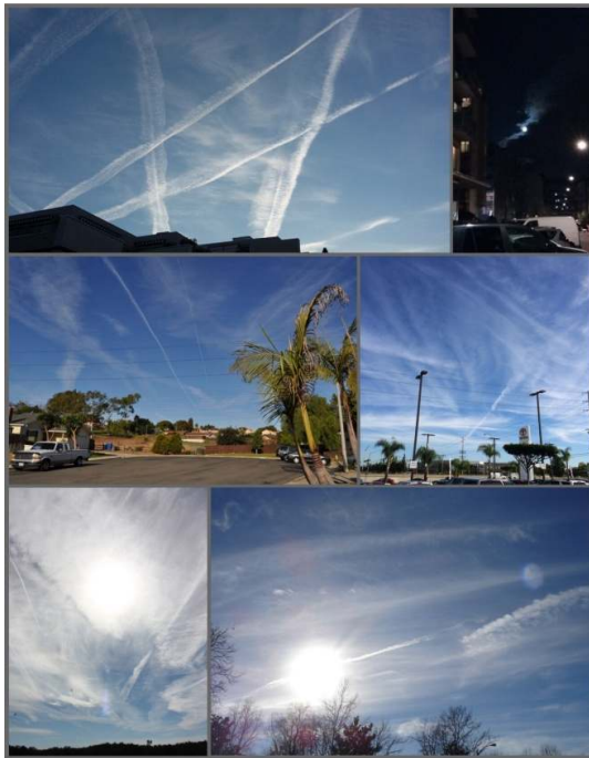
Fig. 1. Images of tropospheric particulate trails in the sky. Top: Geneva Switzerland; Middle: Left, Chula Vista, California (USA); Right, San Diego, California (USA); Bottom: Sacramento, California (USA) showing white particulate haze

submicron pollution particles into the region where clouds form to interfere with moisture droplets coalescing to become sufficiently massive to form rain drops. Since the late 1990s, numerous witnesses have observed particulate trails sprayed by jet-aircraft across the sky. Soon after being released, the trails start to spread out, sometimes briefly appearing similar to cirrus clouds before further spreading to leave a white haze in the sky (Fig. 1). There has been a deliberate effort to deceive the public into believing that the particulate trails are jet contrails made of ice crystals [6]. But contrails only form at low temperatures and high humidity provided there is sufficient water vapor in the aircraft exhaust [15]. Contrails rapidly disappear by evaporation (sublimation) into invisible gaseous water. Contrails do not routinely leave a persistent white haze in the sky as does particulate spraying, which in instances of heavy aerial spraying takes on a brownish hue.