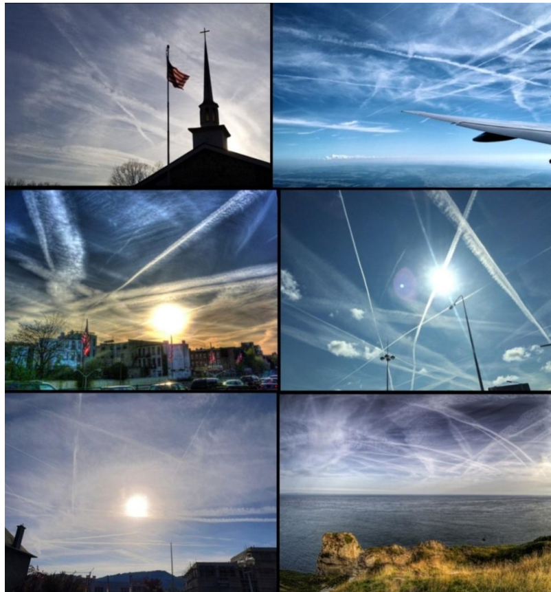
Fig. 1. Geoengineering particulate trails with photographers’ permission [4]. clockwise from upper left: Soddy-Daisy, Tennessee, USA, Reiat, Switzerland, Warrington, Cheshire, UK, Alderney, UK looking toward France, Luxembourg, New York, New York, USA

striping or particulate trails, but more frequently they are called chemtrails . Concerted efforts are made to deceive the public into falsely believing that the jet-laid trails are harmless ice-crystal contrails , which form from high-moisture engine exhaust under very humid, very cold conditions, and which typically evaporate into invisible gas in a matter of seconds [3].