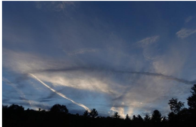
Fig. 4. White and black particulate trails above Danby, Vermont, USA, an impossible combination for alleged ice-crystal 'contrails' [4]

environmental cause of morbidity and mortality worldwide [26,27], have been found in the brains of persons with dementia [28] and in the hearts of persons from highly polluted areas [29]. Air pollution is a major contributor to stroke, heart, and neurodegenerative disease [28-31], lung cancer [32], COPD [33], respiratory infections [34], and asthma [35]. Particulate air pollution is a risk factor for cognitive decline [36-39], and for Alzheimer's Dementia later in life [36]. Particulate air pollution is a risk factor for children having cognitive defects [38,39] and for Autism Spectrum Disorder in children [40,41].