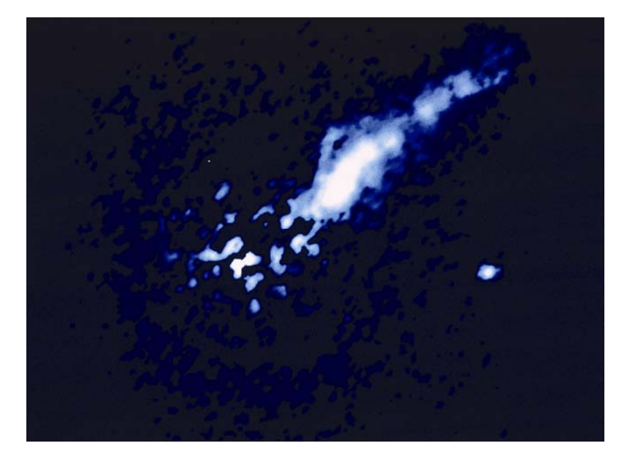
Figure 2. Hubble Space Telescope image of a 10,000 light year long galactic jet. Galaxy light was digitally removed for clarity. Galactic jets as long as 865,000 light years have been observed.

For half a century, the concept that elements are synthesized within stars<sup>32</sup>